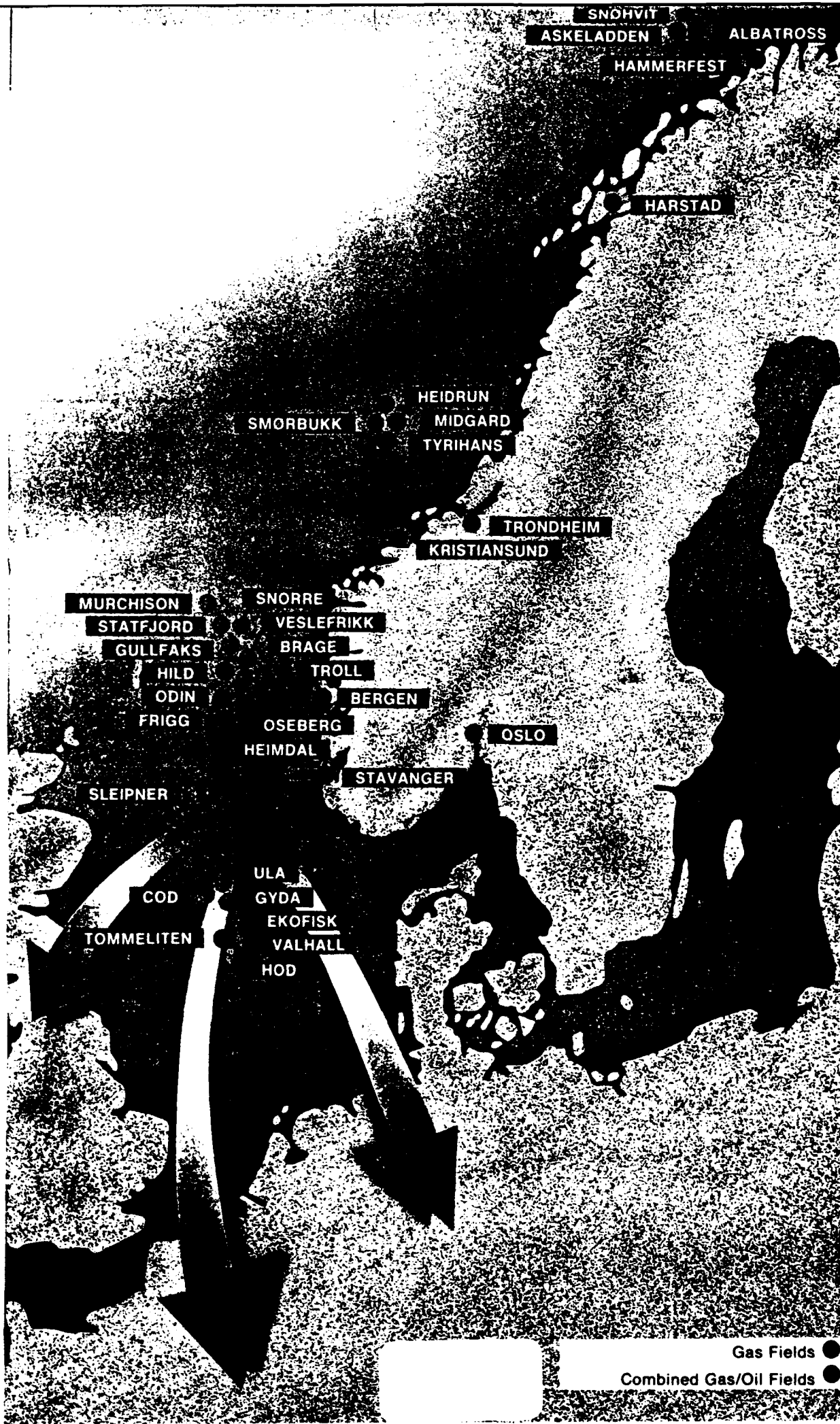
Map showing Norway's gas fields and combined oil/gas fields. Gas is shown as red, oil as green. The arrows indicate main export routes for natural gas from the Norwegian sector.