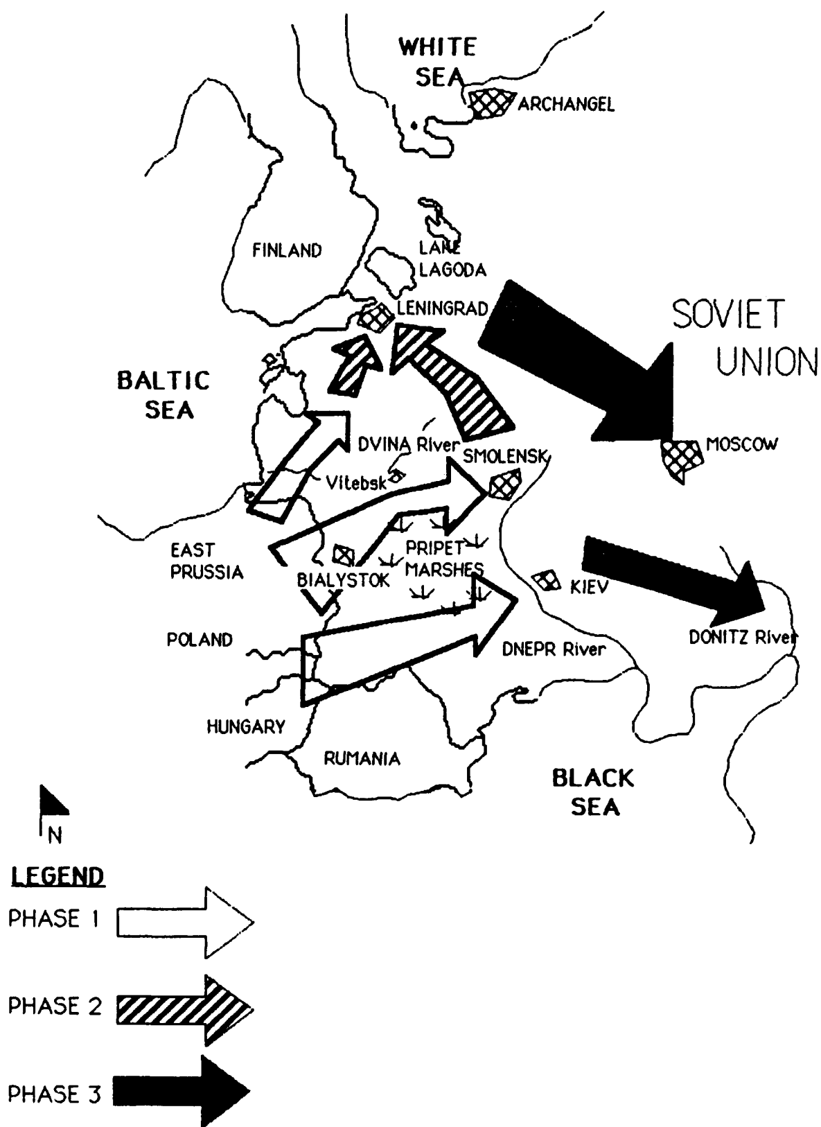
MAP 1. OPERATION BARBAROSSA, 1941