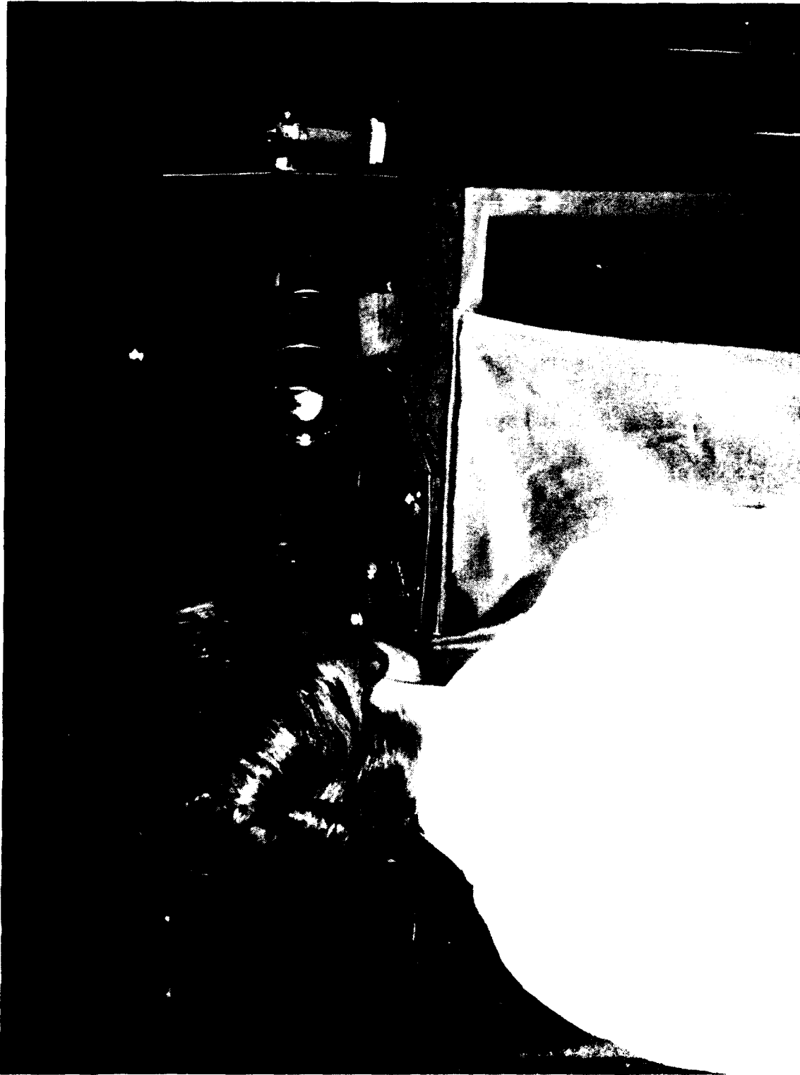
Figure 4. Naval Air Development Center Vision Research Laboratory.