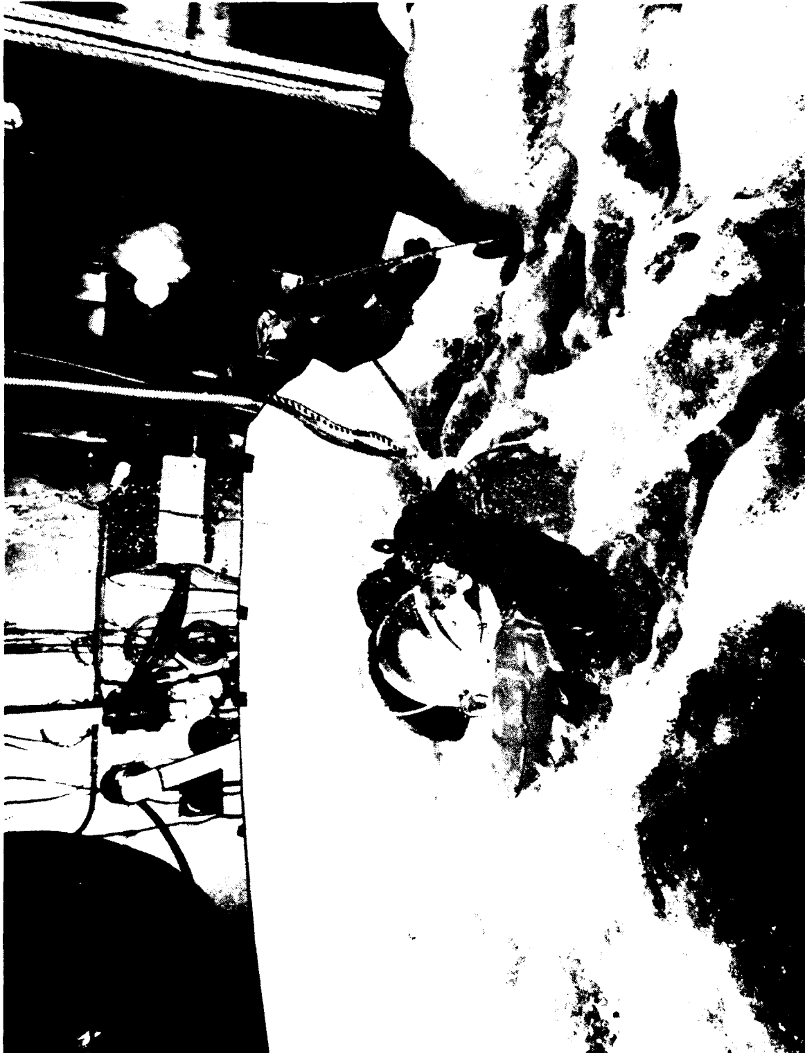
Figure 3. Naval Air Development Center Environmental Physiology Laboratory.