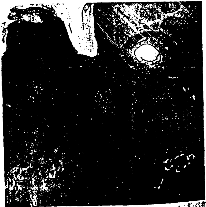
b. Original Infrared Image