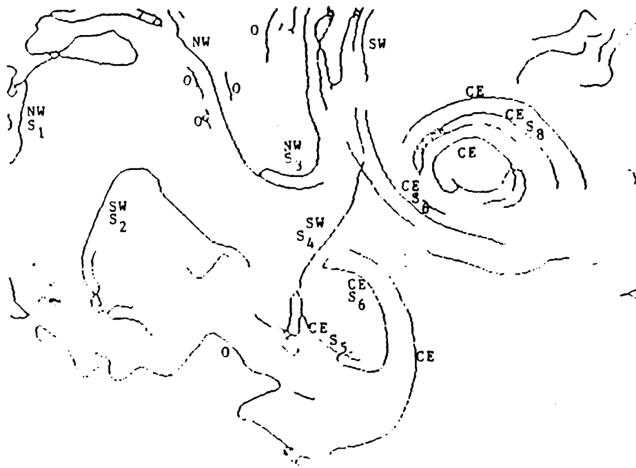
Figure 3. Segmented Image With Correct Labels