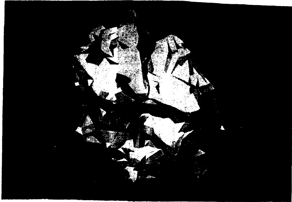
Figure 1. Triangulation of lysozyme for the boundary element calculation of the friction coefficients.