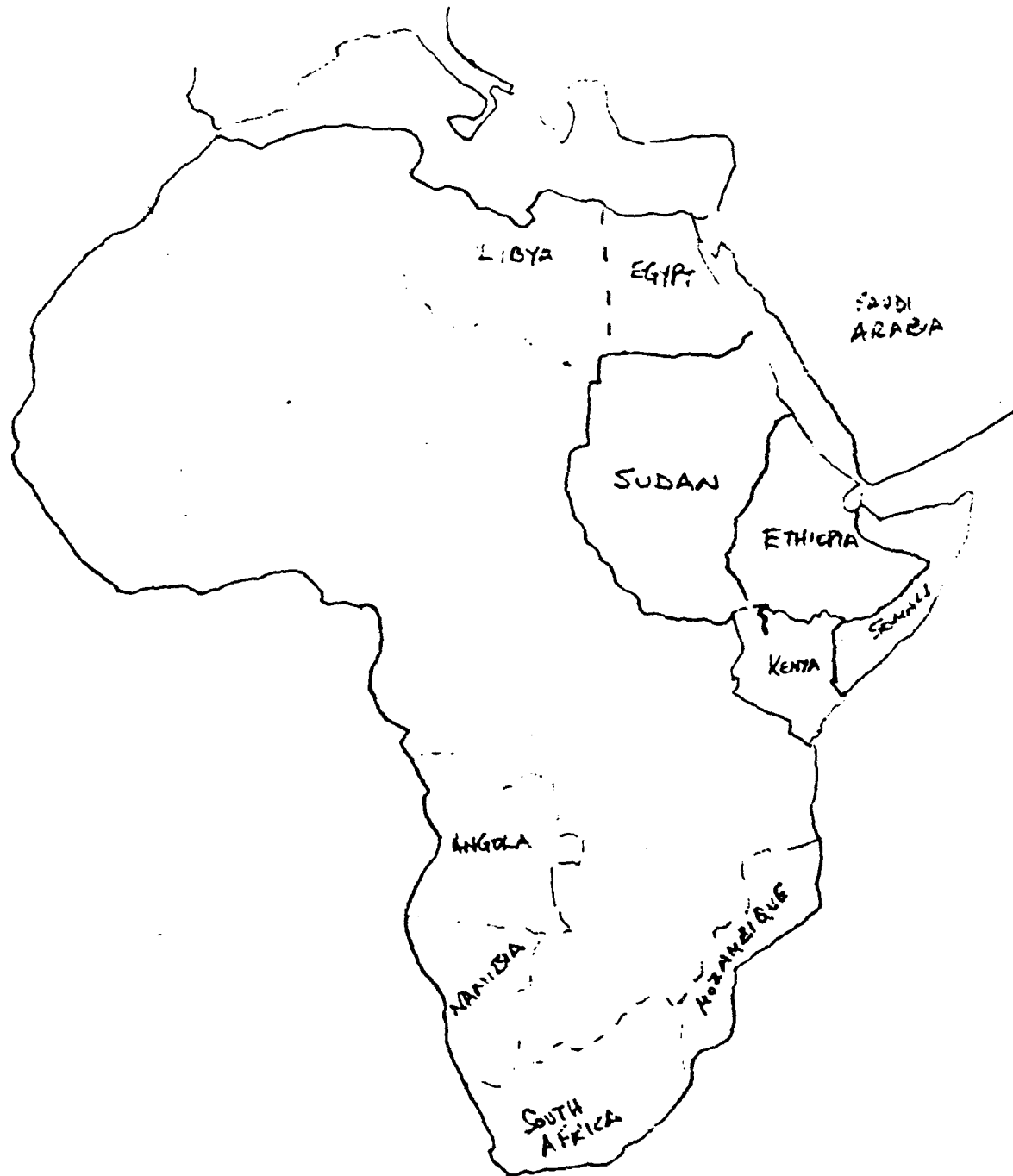
MAP 1 - ANNEX A