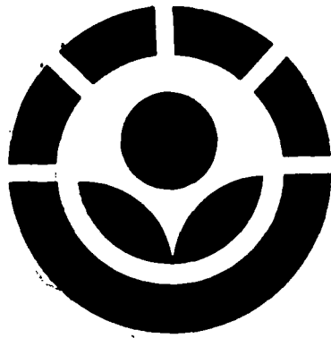
Figure 5: The Radura irradiation symbol.