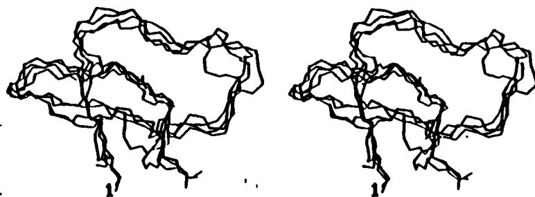
Fig. 1. Stereoview of four different NP-5 structures based on distance geometry conversion of 2-D NMR spectroscopic data.

2. Two-dimensional nuclear magnetic resonance spectroscopy of human and rabbit defensins. 2D-NMR has been used to analyze the solution structures of one rabbit defensin, NP-5, and one human defensin, HNP-1. By methods which are described in detail in an accompanying manuscript proof, the general fold of each of these peptides mentioned above was determined. The structures obtained were derived from data which did not include the disulfide structure which is now known. Interestingly, the location of the disulfide pairs within this defensin are completely consistent with the data obtained by the NMR spectroscopic methods. The NMR approach has generated a family of highly related structures for HNP-1 and NP-5. An example of the structures of NP-5 is shown in Figure 1 below.