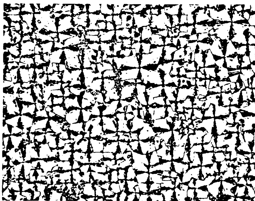
Figure 1: Optical polarization micrograph of poly(IV): cooling cycle, 104°C, magnification 300x, annealed for 24 hrs.

The polymers obtained from the monomers III, IV and V exhibit highly ordered smectic mesophases, similar to those reported for the corresponding polymers obtained from methacrylates, acrylates or propenyl ether monomers (8, 9). A typical texture for these polymers is shown in Figure 1.