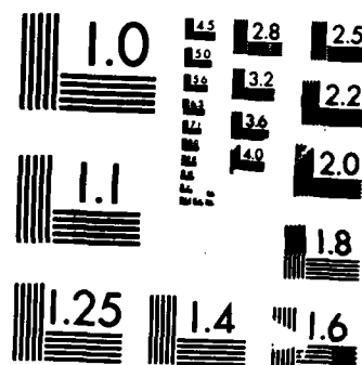
MICROCOPY RESOLUTION TEST CHART NATIONAL BUREAU OF STANDARDS-1963-A