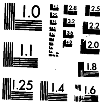
MICROCOPY RESOLUTION TEST CHART NATIONAL BUREAU OF STANDARDS-1963-A