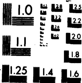
XERO COPY RESOLUTION TEST CHART