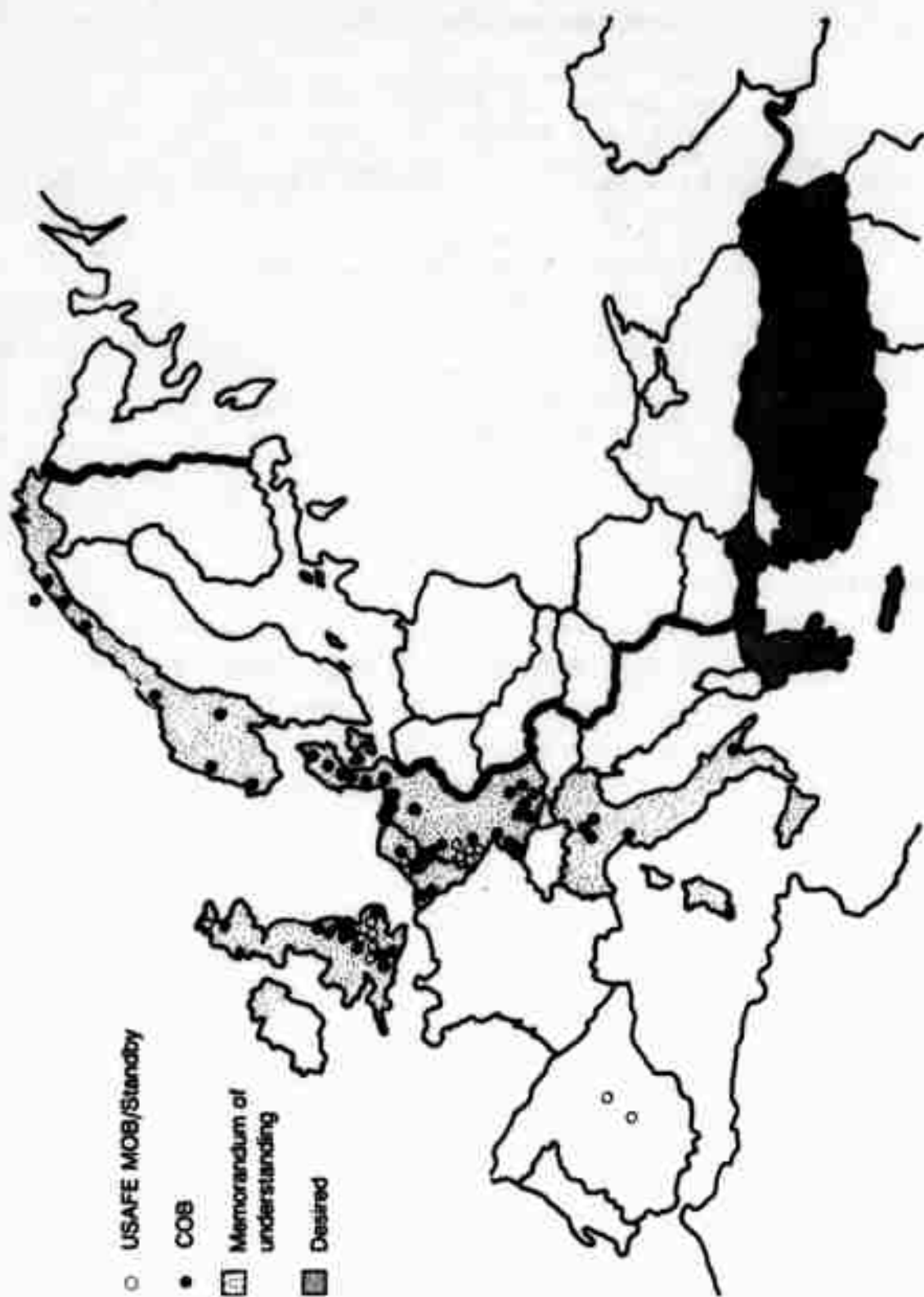
Fig. 1—NATO basing agreements and COBs, 1984