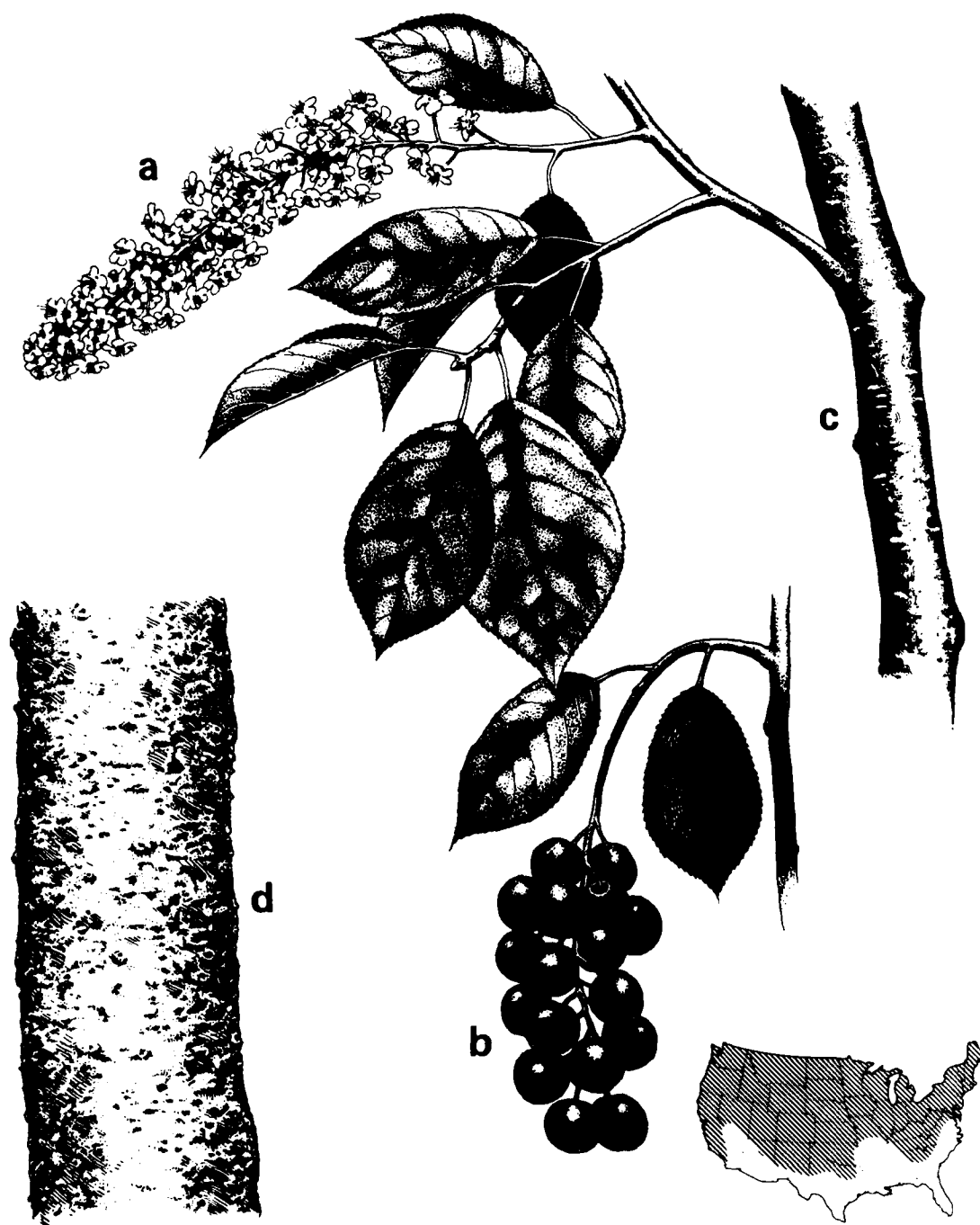
Figure 1. Distribution and distinguishing characteristics of common chokecherry ( Prunus virginiana ): (a) flowering branch and leaves, (b) fruit, (c) young stem with lenticels, and (d) older trunk with roughened bark