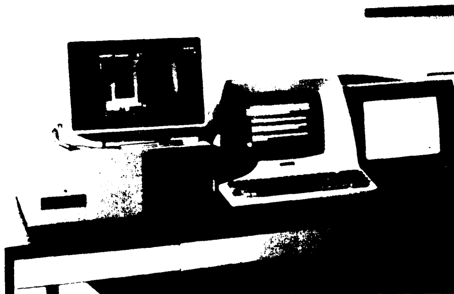
Figure 1. Low-Cost Avionics Trainer.

The same system was used for both training development and training delivery. Each student sat at a table containing the computer equipment and monitors. Simple instructions were provided on how to initiate lessons by making minimal inputs via the computer terminal keyboard. Text displayed on the monitor explained the lessons and prompted student responses. The FSAS control panel (slightly enlarged from actual size) was displayed on the graphics monitor, and the students could simulate operating it by touching the display screen while they followed the text instructions (Figure 1). Student inputs were judged for correctness by the system, and remedial prompting was provided as required. The students received explanations and guided practice on each task. Self-tests permitted the students to assess their own competency on each task before proceeding to the next lesson.