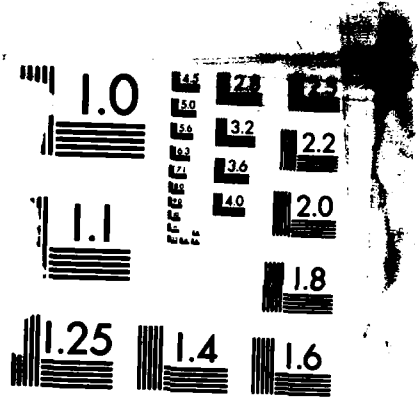
MICROCOPY RESOLUTION TEST CHART NATIONAL BUREAU OF STANDARDS-1963-A