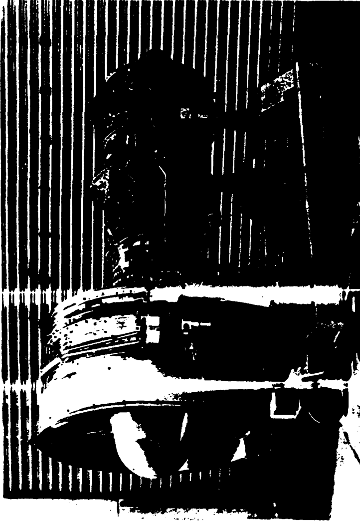
Fig. 1. Japan's own 14,000 lbs. thrust (experimental) medium cruising range turboprop engine (from IHI brochure). See text for discussion.