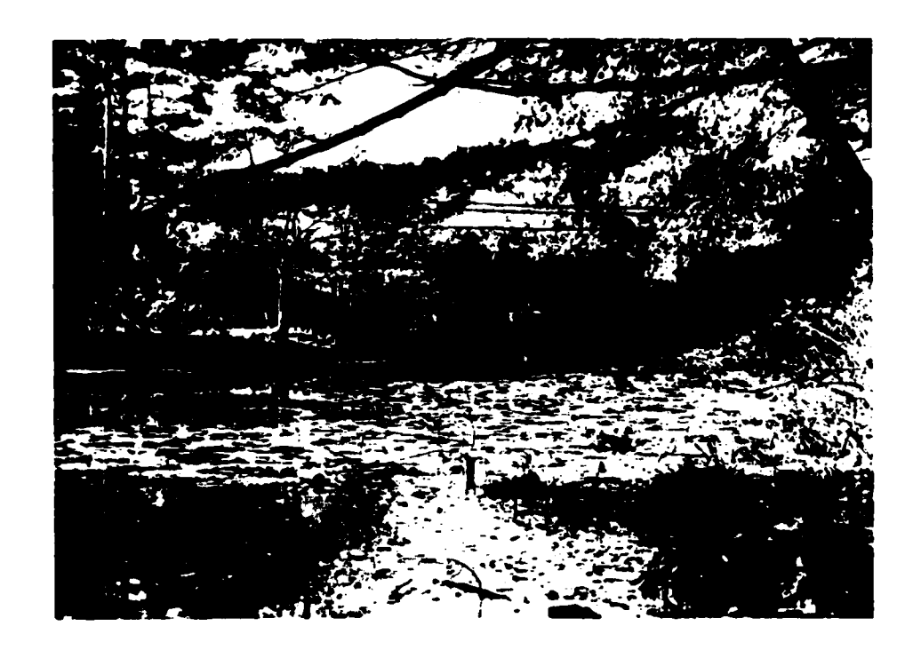
PHOTO NO. 1 - This photograph shows the inlet (East Main Street Bridge) to the upstream outlet channel, which leads to the dam. The dam is about 50 feet downstream of this roadway embankment, and natural ground area.