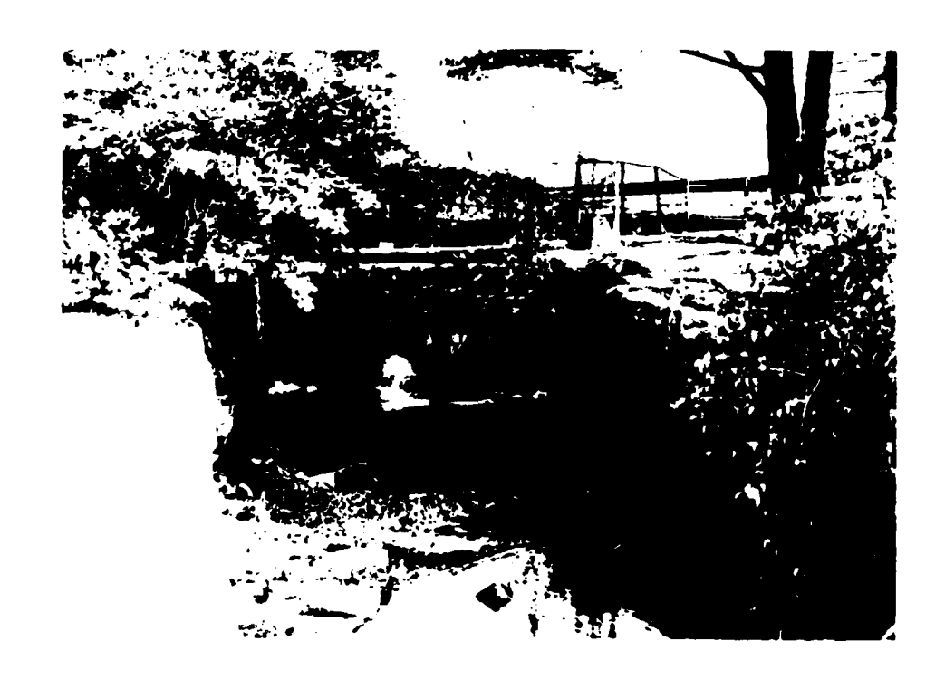
PHOTO NO. 2 - This photograph shows the downstream face of the stone masonry dam. Its dimensions are 15± feet long by 8± feet high. The area adjacent to the downstream brook channel is undeveloped except for several roads.