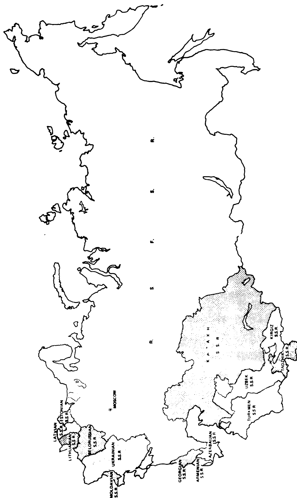
Fig. 1—USSR administrative divisions