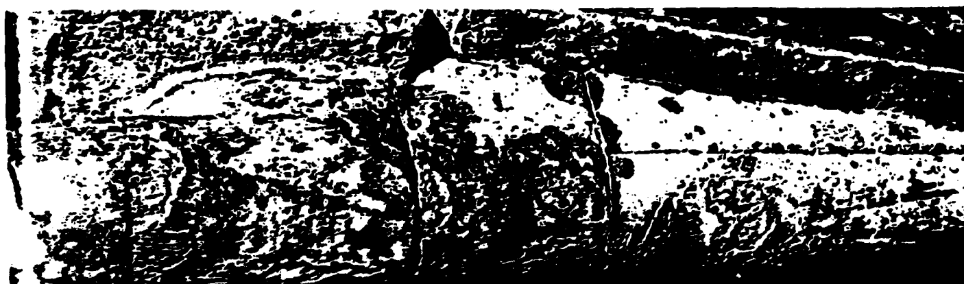
Fig. 6. Corrosion on stern tube

Another important mark of galvanic corrosion is the formation of hydrogen on the cathode and the formation of blisters in the paint, which is caused by the alkaline nature of the cathode products. This blistering impairs the process, for the cathodic region which is exposed to the seawater does not become enlarged. In order to preclude galvanic corrosion, dissimilar metals and unfavorable surface conditions must be avoided. In considering the effect of ununiform surface conditions, the influence of the paint must also be taken into account.