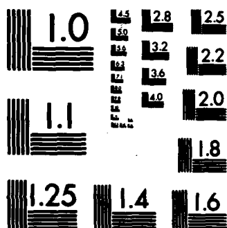
MICROCOPY RESOLUTION TEST CHART NATIONAL BUREAU OF STANDARDS-1963-A