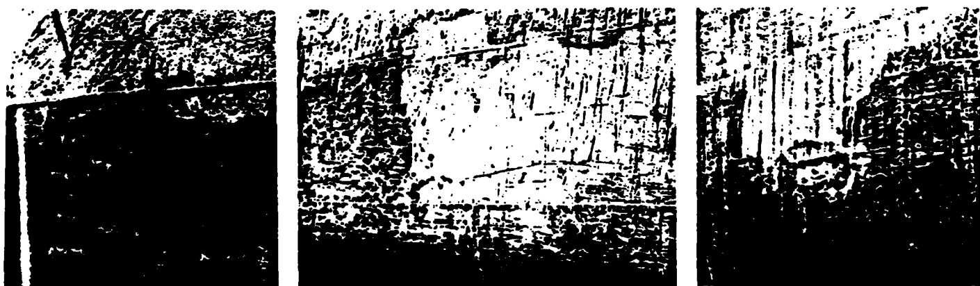
Figs. 1 to 3: Weld seams and points, where steel surfaces are exposed to mechanical or similar abrasion, are in special need of protection

As in the case of pitting due to stray currents, here, too, white salt deposits appear on the cathode from the flow of the current through the seawater. Whenever those white salt deposits occur, one can be sure that galvanic corrosion is occurring, for those deposits are on the cathode, which initiated the corrosion. /197