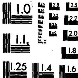
MICROCOPY RESOLUTION TEST CHART NATIONAL BUREAU OF STANDARDS-1963-A