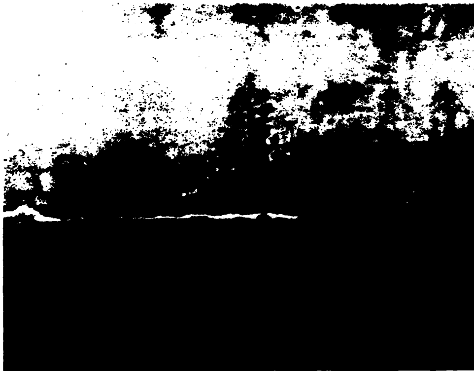
ESMERALDAS during sea trials. Note the after helicopter platform and the ALBATROS launcher abaft the mast (CNR).

The safety service has one fire main with eleven stations, fixed immersible electric pumps for suction and fire fighting, sprinklers in the ammunition rooms, power pumps on wheels, a stationary plant for the engine spaces which automatically determines the stoppage of the ventilating machinery and