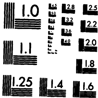
MICROCOPY RESOLUTION TEST CHART NATIONAL BUREAU OF STANDARDS-1963-A