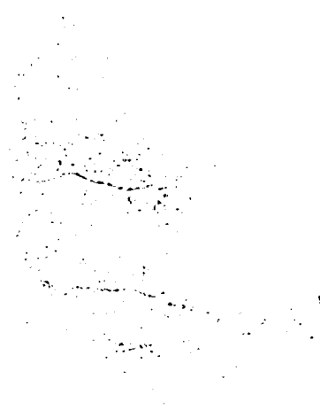
1. Chlorophyll a and Chlorophyll b were determined by the method of Arar and Collins (1971) using a Shimadzu 1601 UV-Visible Spectrophotometer. The concentration of chlorophyll was expressed in \mu\text{g mL}^{-1} .