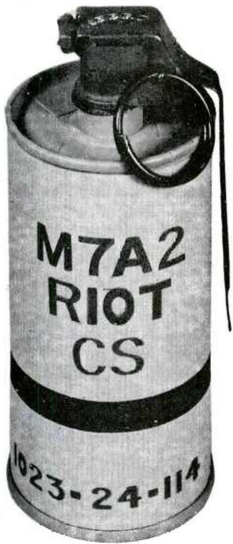
Figure 1. M7 Series Riot Control Grenade