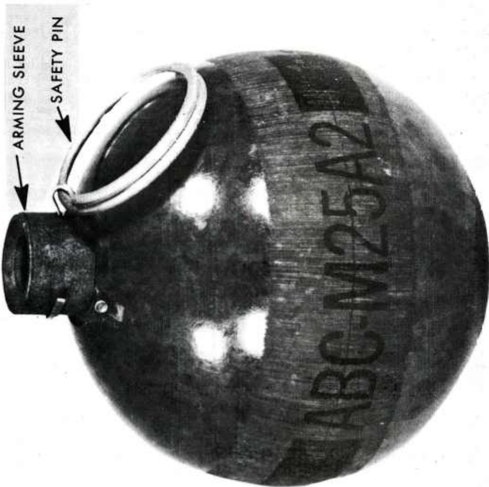
Figure 2. M25 Series Riot Control Grenade