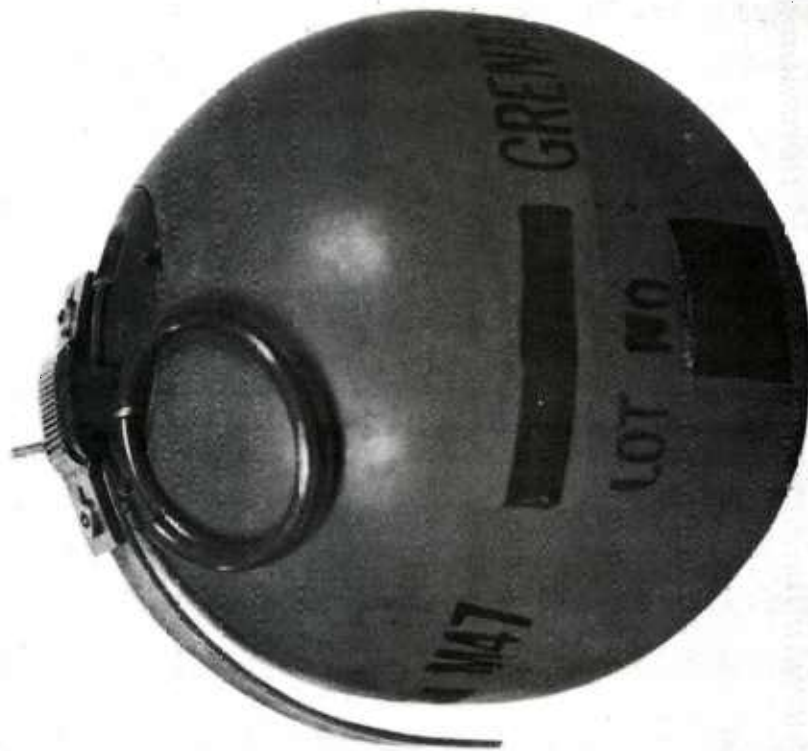
Figure 3. M47 Riot Control Grenade