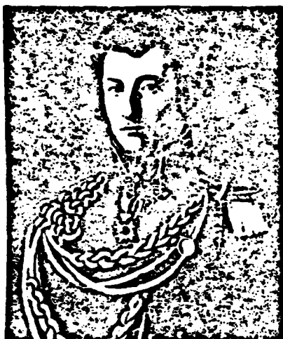
Carl von Clausewitz im Jahre 1812

the Great, Prussia had already gained the reputation of being the most tolerant civilized state of its time. With the Stein/Hardenberg reforms the switches were thrown for a liberal and social development which was to find its crowning conclusion in the basic constitutional law of the Federal Republic of Germany 150 years later.