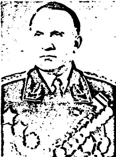
Photograph: Sergei Gorshkov, Fleet Admiral of the Soviet Union, Commander in Chief of the Soviet Navy

Admiral Gorshkov, the Commander in Chief of the Soviet naval forces, now 71 years of age, has occasionally been called "the Red Tirpitz." German Chancellor Schmidt has called him "the greatest military genius in the world today."