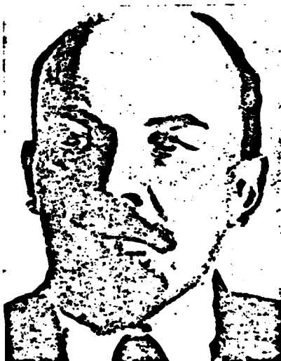
Photograph: Lenin (actually Vladimir Ilyich Ulyanov), founder of the Union of Socialist Republics

Any attempt to guide the revolution into democratic paths at the last moment were doomed to failure.