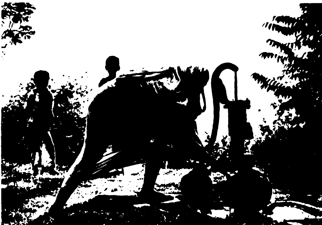
A MOTHER IN BANGLADESH PUMPS WATER FROM A NEWLY INSTALLED TUBEWELL.

Other international agencies are involved in water resources activities in developing countries, including private and voluntary organizations (PVOs). For example, the Cooperative for American Relief Everywhere, Inc. (CAPE), used about $10 million in 1977 for water supply and sanitation, according to a CARE official. Other active PVOs include the Catholic Relief Services, Church