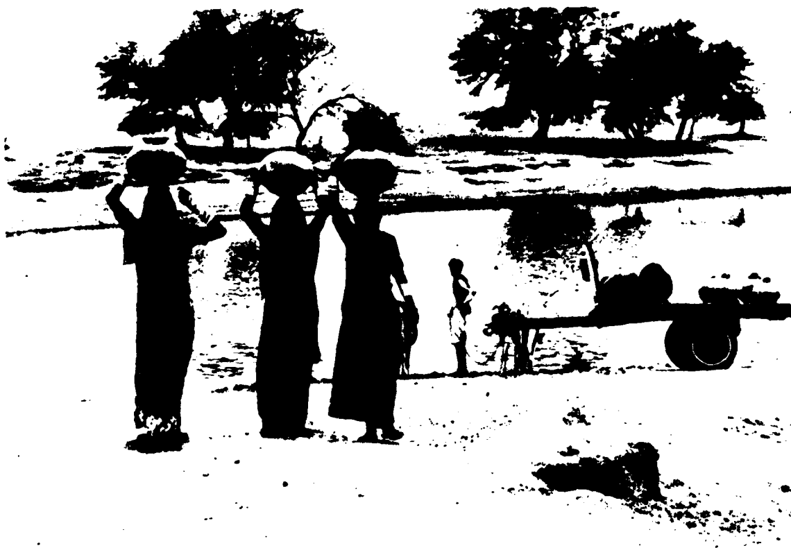
A heavy daily burden for these women of India--and the water is not safe.

The U.N. Conference on Human Settlements held in Canada in June 1976 recommended that quantitative targets be set by nations to ensure that their people have access to safe water supplies and hygienic waste disposal by 1990. The U.N. Water Conference held in Argentina in March 1977 pursued this theme further by recommending that member nations reaffirm their commitment to adopt programs having realistic standards for quality and quantity of drinking water for urban and rural areas by 1990 and that they should prepare plans for 1980 to provide such coverage and to expand and maintain existing systems. The Conference asked member nations to