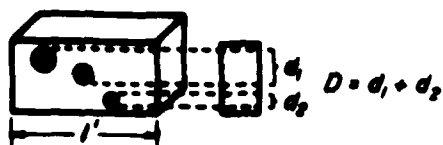
Figure 1.—Assumed cross-sectional area of knots in 1-foot interval of unit depth projected on end of the interval.