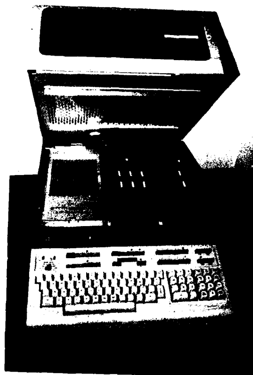
Fig. 3 — Interior View of HP264X Intelligent Terminal