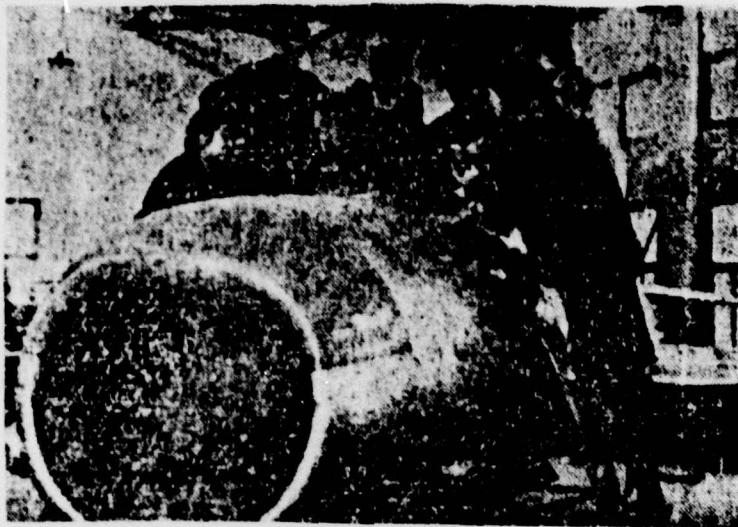
Students majoring in Aircraft Design are studying the structures of an aircraft at N.A.C.