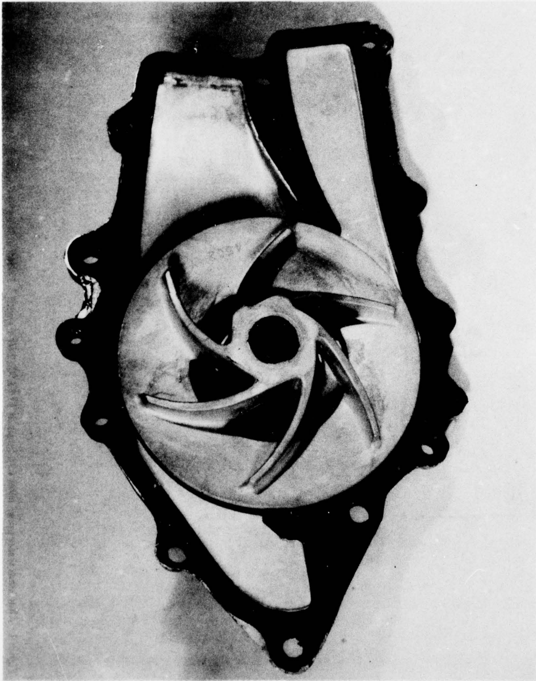
Figure 2. Aluminum water pump after 700 hours at 115.5°C (240°F) with 3-percent Blend 18 in corrosive water.