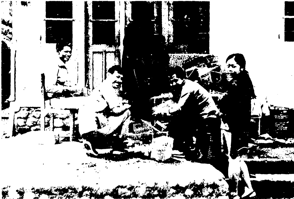
Illustration. Animal trappers preparing live catch traps on a recent field trip in East Java.

study and become friends together, completely disregarding international boundaries and political ideologies. Such a pre-college educational environment is truly an effective step towards promoting international good will and mutual understanding among the world's future leaders.