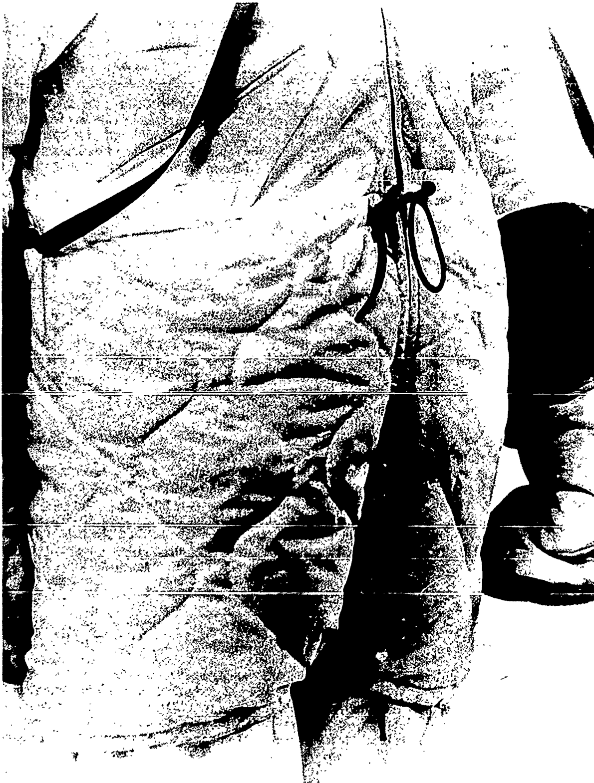
Figure 1. Slide fastener pull in relation to mitten-encased hand. (Note the small size of the pull and the improper attachment to the fastener tab.)