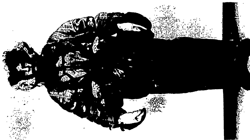
Figure 4. Experimental clothing ensemble on largest subject- front view. (Lengths of trouser legs and parka arms are marginally acceptable for this subject, whose stature and crotch height are well above average, but whose other dimensions dictate medium size clothing.)