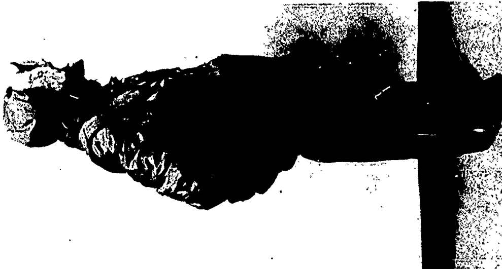
Figure 3. Experimental clothing ensemble on smallest subject- side view. (Slide fastener along side of trouser leg shows clearly. Observe that lack of an ankle tie exposes the lower closure button and slide fastener to fouling from mud or snow.)