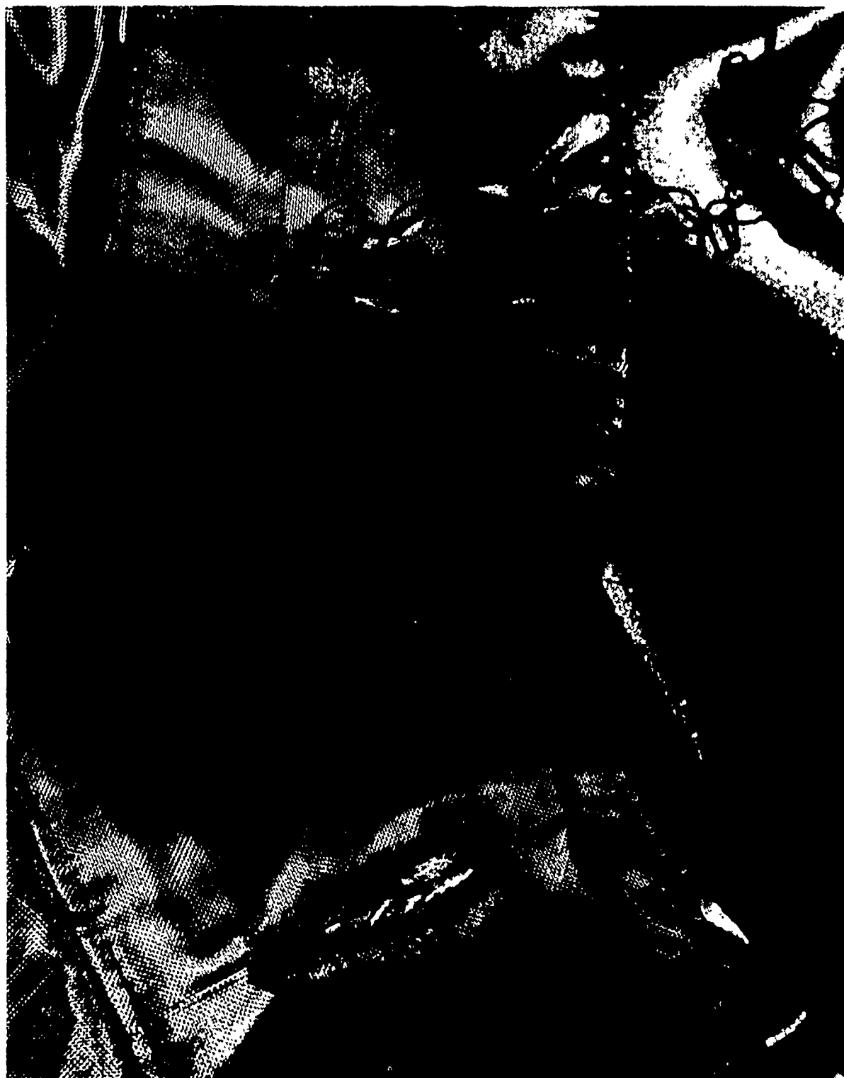
Figure 7. Buttonholes on neckband of parka- O.D. side. (Buttonhole stitching has failed completely on upper buttonhole after four experimental trials. Hood is attached to parka and removed twice for each trial. Lower buttonhole shows the severe fraying that occurs in the nylon shell material even before buttonhole stitching fails.)