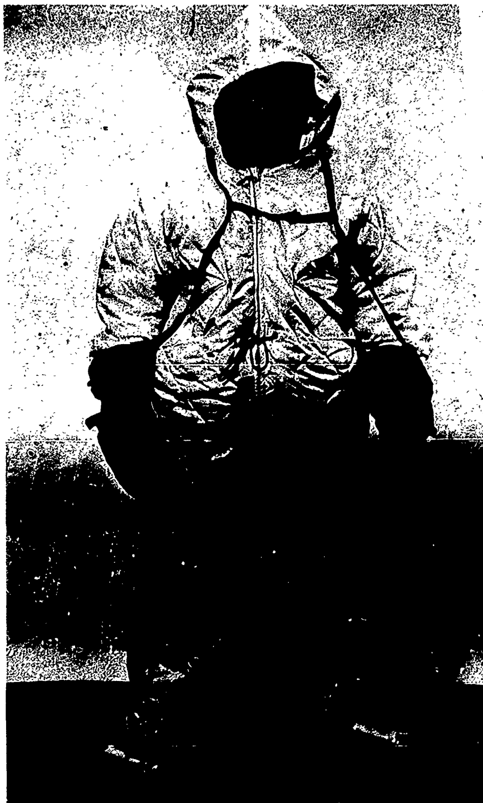
Figure 9. Experimental clothing ensemble worn in camouflage mode. (Clothing ties and slide fastener pulls of O.D. color are much too prominent against the shining white nylon of the parka shell. O.D. buttons on trouser leg closures, not visible in this photograph, are equally prominent.)