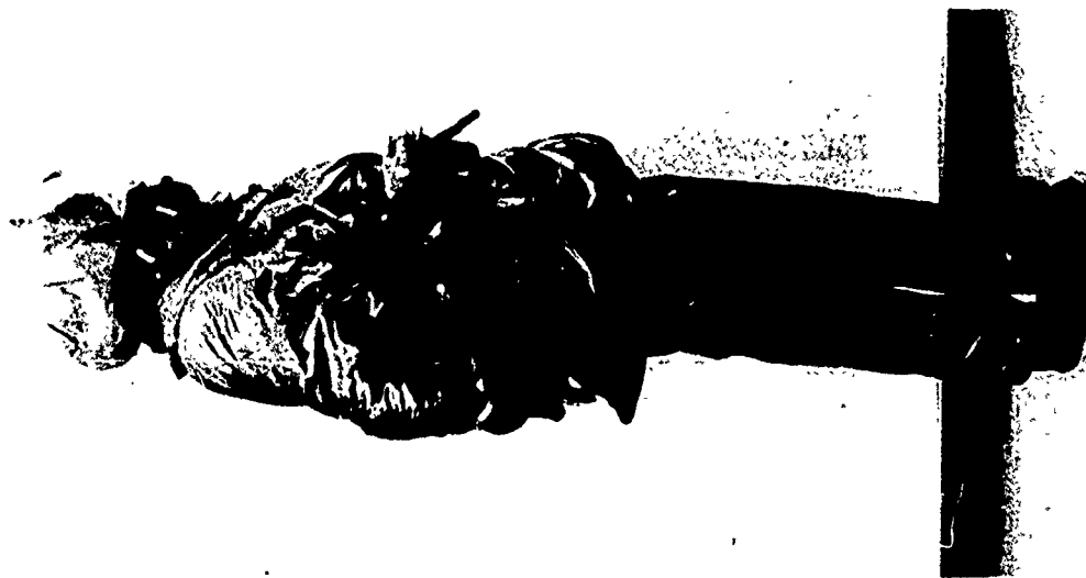
Figure 5. Experimental clothing ensemble on largest subject- side view.