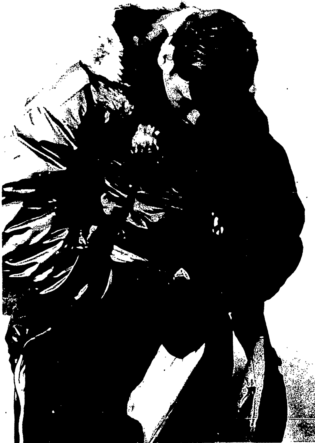
Figure 6. Subject ready for urination. (Both hands are cold exposed [one is bare]. Right thigh is extensively uncovered by arctic trousers. Extensive and awkward effort is required to hold back loose flaps of both arctic trousers and parka.)