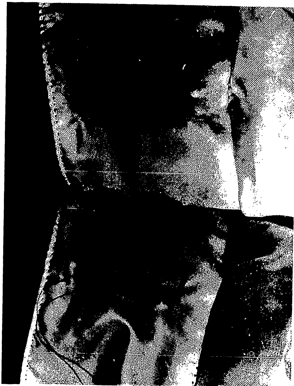
Figure 8. Buttonholes on neckband of parka- white side. (Illustrates the opposite side of the same buttonholes shown in Figure 7.)