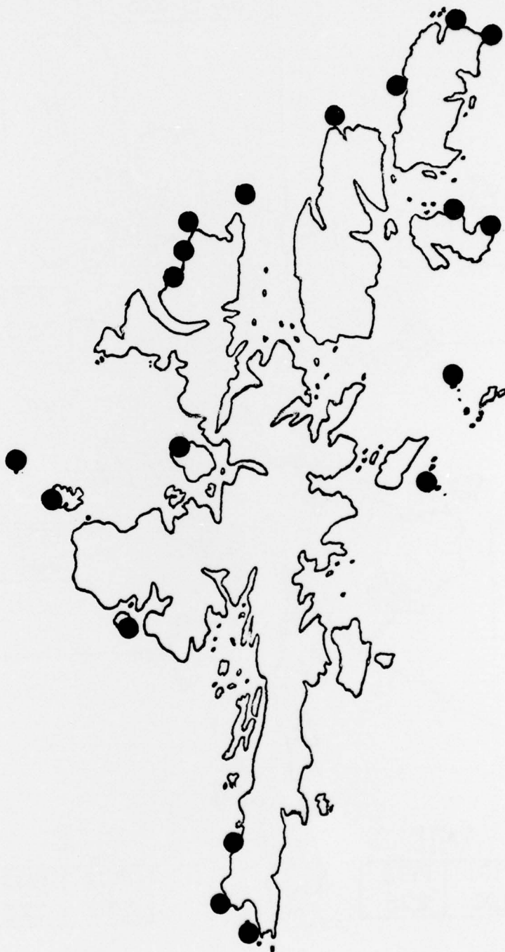
Fig. 2. Grey seal breeding sites in Shetland.