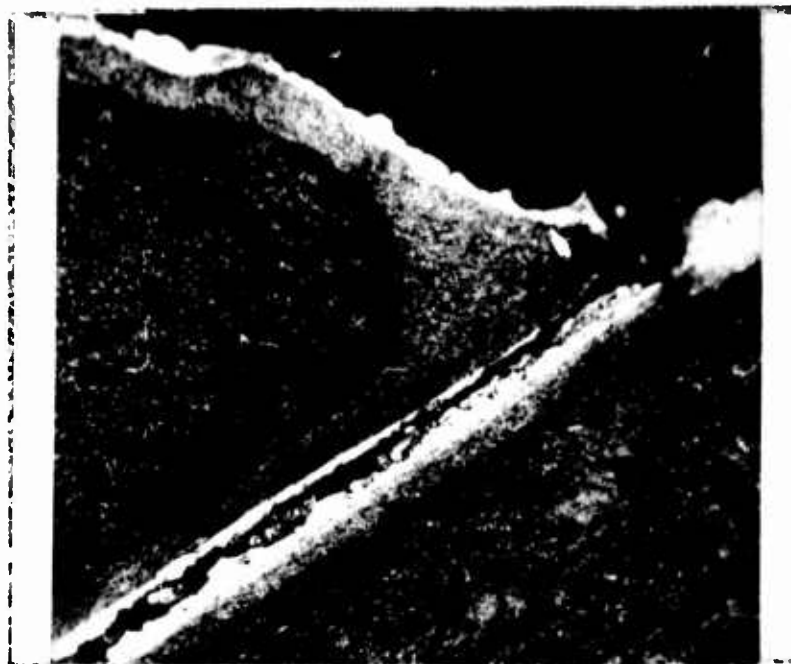
FIG. 6 White Layer in Shear Crack (Top 8X, Bottom 250X)