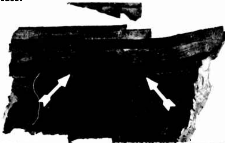
FIG. 2 Unflattened Land at Band (IX)

The location of the projectile rotating band in the tube at the time of detonation is sometimes indicated by a brassy "glint" in the form of a circumferential band around the bore surface. Depending upon the force of detonation, a ring of indentations may be formed at the location of sharp corners at the edge of the steel shell body and the rotating band. In some instances, the soft metal of the band serves to protect the bore area underneath, and results in less flattening of the bands than occurs where the steel shell body contacts the bore surface.