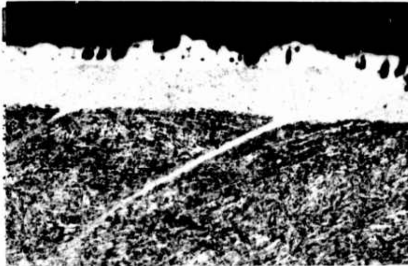
FIG. 4 Adiabatic Shear (500X)

One of the more striking features produced by any order of detonation with sufficient force to rupture a tube is the martensitic streaks, which have been described as being caused by adiabatic shear (2). These indicate the presence of intense shear loading but,