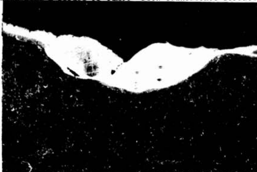
FIG. 5 Layers on Shell (100X)

Another unusual condition has been noted on the surface of both tube and projectile fragments from in-bore prematures. A duplex white layer has been observed; this resembles the white layer seen by many examiners of worn gun tubes, believed to result from heat and the nitrogen from the propellant gases. One reference (3) reports the observation of three distinct zones: a) a subsurface tempered zone, softer than the underlying steel; b) a rehardened light etching, nearer the surface area; and c) a darker etching platelet containing layer at the surface. We have observed similar layers on tube and shell fragments and, at least in the case of the shell, the transformations resulted from the single explosion, not a large number of rounds fired over a period of time. Such transformed surface layers