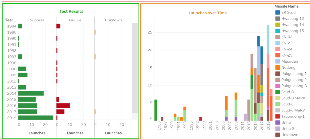
North Korea Missile Test Tracker 2020 (Figure 2) 57

The United States sabotage may have achieved tactical effectiveness in providing another mechanism to defend against a ballistic missile attack and causing North Korea to doubt the reliability of its missile systems and technology. However, the sabotage attacks have not achieved strategic success in that they did not effectively coerce North Korea to discontinue its nuclear and weapons proliferation, significantly disrupt North Korea’s ballistic missile testing, nor did it force them to seek out negotiations with the United States. Still, the United States’ sabotage of North Korea’s ballistic missiles, similar to Operation Olympic Games conducted against Iran’s nuclear program, has demonstrated its limited effectiveness in supporting the maximum pressure campaign against North Korea. The sabotage creates doubt and exposes vulnerabilities in North Korea’s primary deterrence strategy, as well as increasing the leverage of the United States’ maximum pressure campaign.