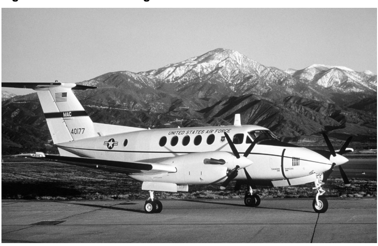
Figure 2: C-12 Beech King Air

Propulsion: Propeller Passenger Capacity: 8 Speed: 260 knots Range: 1,200 nautical miles Number: 163