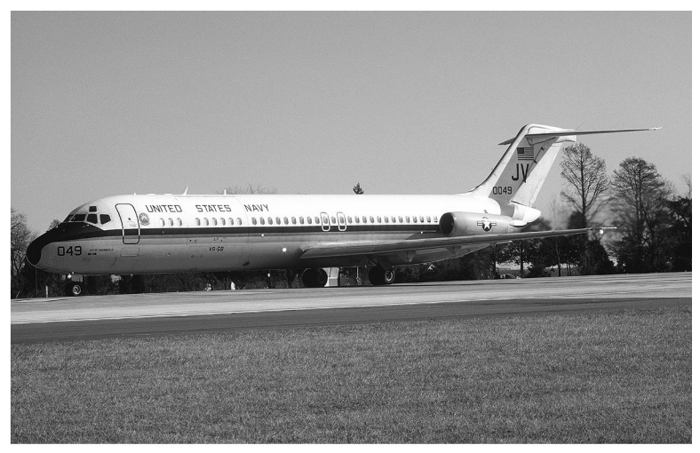
Figure 1: C-9 McDonnell Douglas

Propulsion: Jet Passenger Capacity: 90 Speed: 440 knots Range: 2,000 nautical miles