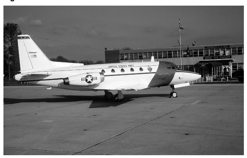
Figure 11: CT-39 Rockwell-60

Propulsion: Jet Passenger Capacity: 6 Speed: 430 knots Range: 1,200 nautical miles