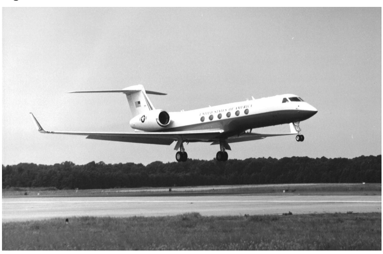
Figure 8: C-37 Gulfstream V

Propulsion: Jet Passenger Capacity: 12 Speed: 520 knots Range: 5,500 nautical miles Number: 1