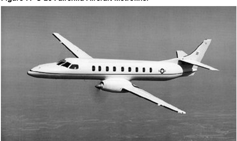
Figure 7: C-26 Fairchild Aircraft Metroliner

Propulsion: Propeller Passenger Capacity: 14 Speed: 265 knots Range: 1,100 nautical miles