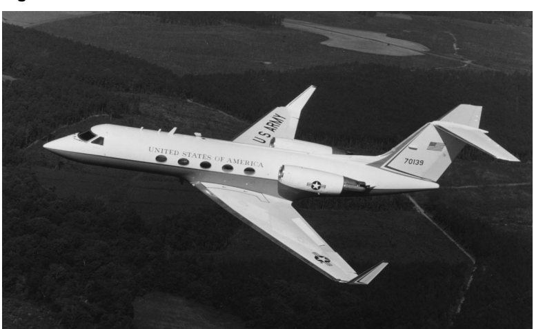
Figure 3: C-20 Gulfstream III

Propulsion: Propeller Passenger Capacity: 8 Speed: 260 knots Range: 1,200 nautical miles Number: 163