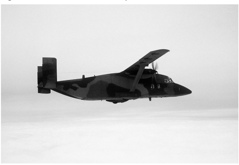
Figure 6: C-23 Short Brothers Sherpa

Propulsion: Propeller Passenger Capacity: 18 Speed: 180 knots Range: 600 nautical miles