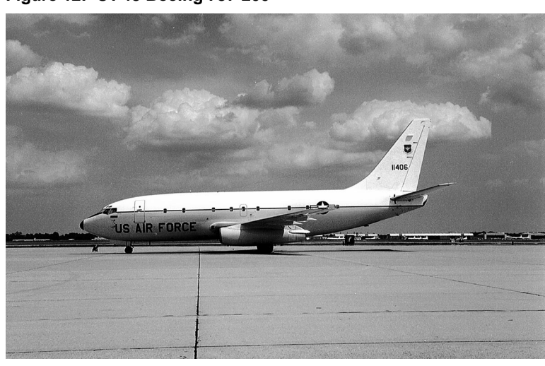
Figure 12: CT-43 Boeing 737-200

Propulsion: Jet Passenger Capacity: 38 Speed: 420 knots