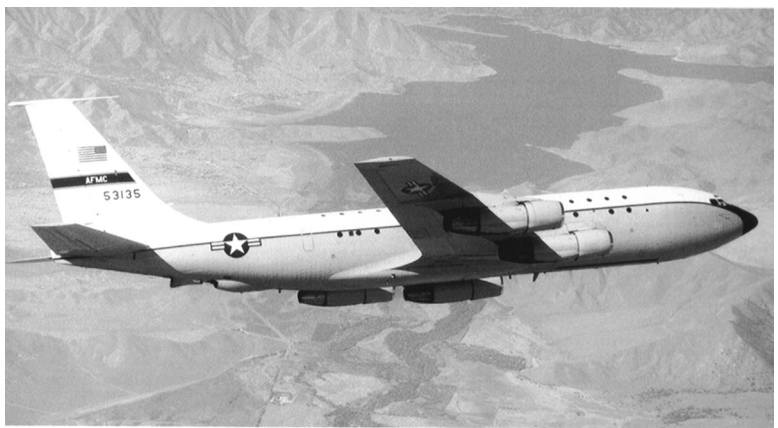
Figure 10: C-135 Boeing 707

Propulsion: Jet Passenger Capacity: 20 Speed: 475 knots Range: 5,000 nautical miles