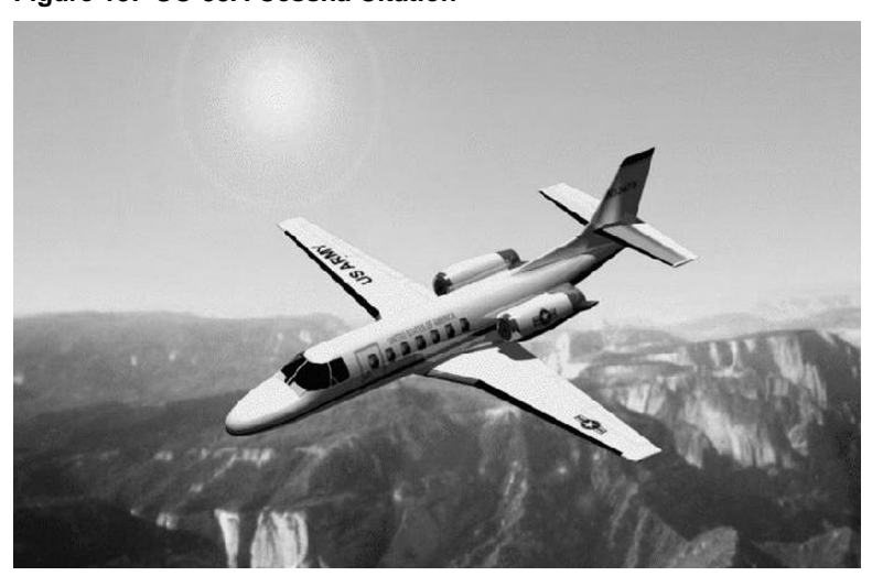
Figure 13: UC-35A Cessna Citation

Propulsion: Jet Passenger Capacity: 7 Speed: 420 knots