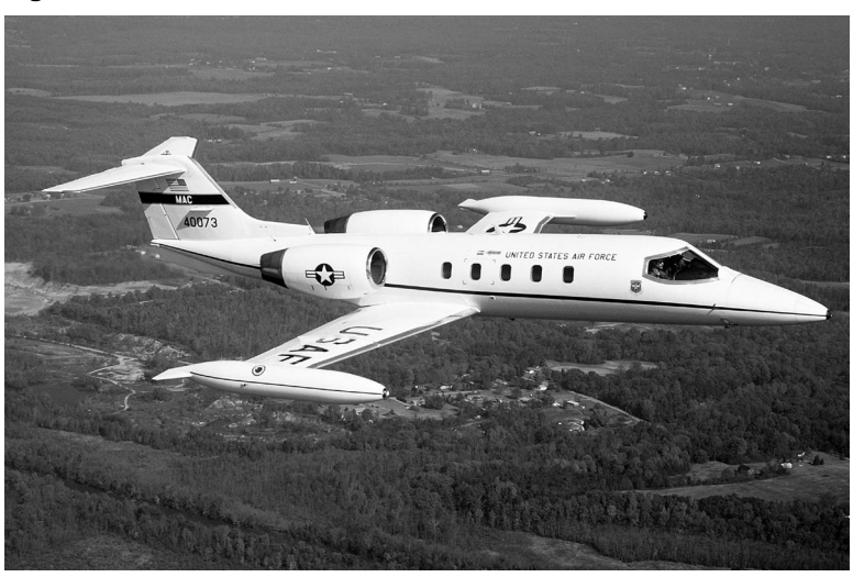
Figure 4: C-21 LearJet 35A

Propulsion: Jet Passenger Capacity: 7 Speed: 440 knots