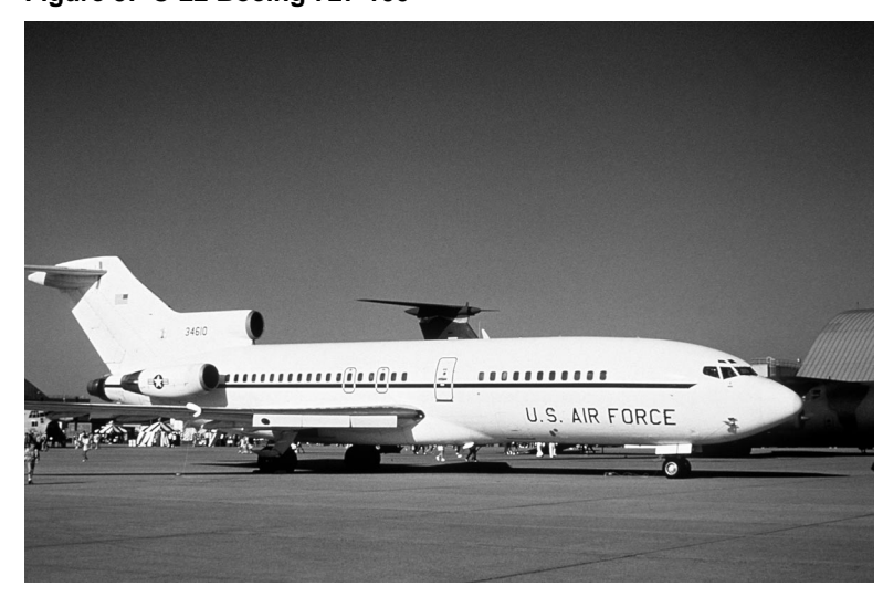
Figure 5: C-22 Boeing 727-100

Propulsion: Jet Passenger Capacity: 77 Speed: 460 knots