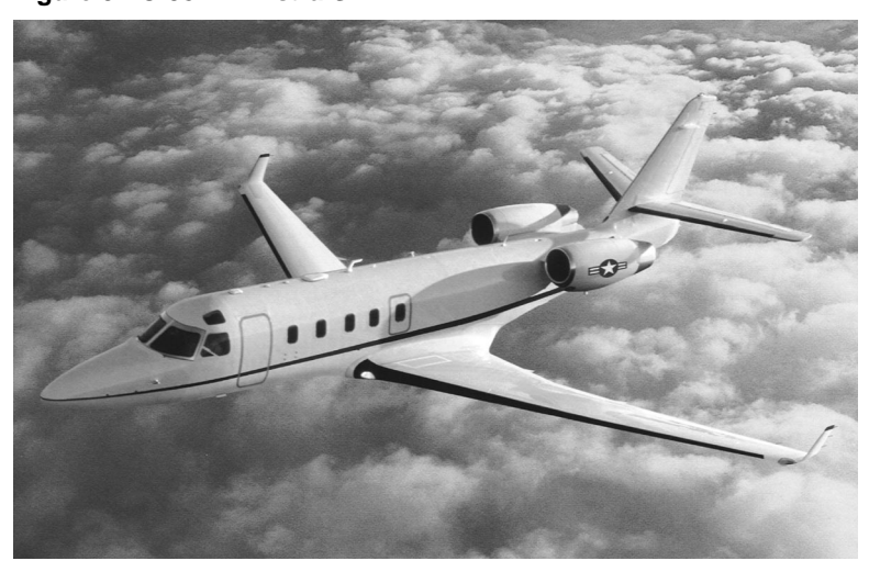
Figure 9: C-38 AIA Astra SPX

Propulsion: Jet Passenger Capacity: 12 Speed: 520 knots Range: 5,500 nautical miles Number: 1