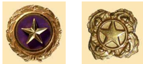
Figure 2. Gold Star Lapel Button (left) and Next of Kin Lapel Button (right)