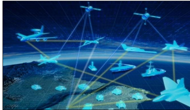
Figure 2. Visualization of JADC2 Vision