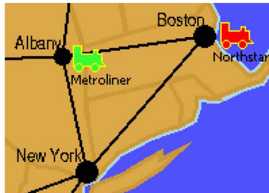
Figure 2: Trains Scenario

minimally different examples. We use the TRAINS-96 domain [Allen et al. , 1996], in which a user interacts with a dialogue system to provide routes for trains. Figure 2 illustrates an episode from this task, in which there are two trains of interest, Northstar, which is currently at Boston, and Metroliner, which started the task at Boston, but is now at Albany. Given this same context, consider the dialogues in (9) through (15).