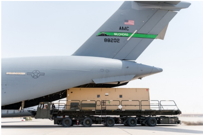
Figure 1. Negatively Pressurized Conex (NPC). The top photo shows an NPC being loaded onto a C-17 Globemaster III . The bottom photo shows the interior of an NPC .