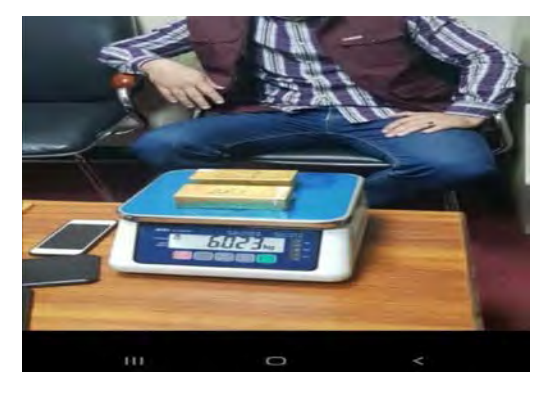
Photo 4 - 1/3 of the Gold Three Passengers were Attempting to Smuggle out of the Country Through the non-VIP Terminal