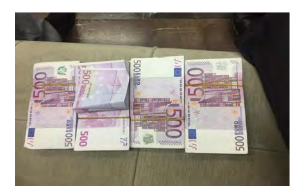
Photo 3 - Cash Seized Following the Detection of a Smuggling Attempt by an Afghan Member of Parliament Through the VIP Passenger Terminal