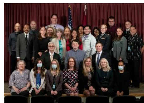
DCI Staff 2021

Madigan Preventive Medicine Residency Program, and was at the forefront of numerous outbreaks during his distinguished military medical career. He outlined the Department of Defense's (DoD) response to COVID-19 and highlighted the need for military medical research to keep us ready, resilient and responsive for the next outbreak.