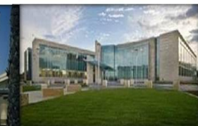
Post Graduate Dental School