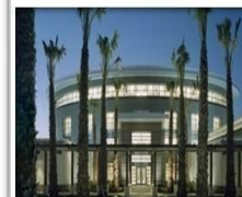
Center for the Intrepid