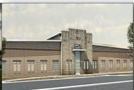
Tri-Service Research Laboratory