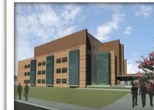
Battlefield Health & Trauma Research Institute