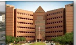
San Antonio Military Medical Center