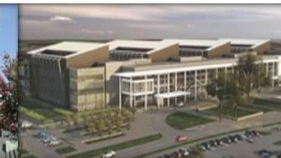
Wilford Hall Ambulatory Surgical Center