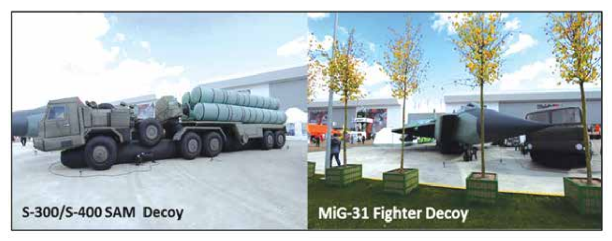
Figure 7. Inflatable Decoys Displayed by Scientific Production Enterprise RUSBAL at ARMY-2016

(1) seeks the wireless signal of any other drone in the area, (2) forcefully disconnects the wireless connection of the true owner of the target drone, (3) authenticates with the target drone, pretending to be its owner, (4) feeds commands to the target, and (5) takes control of the target UAV's on-board computer. Kamkar has made public all the technical specifications anyone needs to build an aerial hacker drone of their very own.