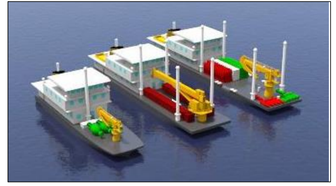
showing indicative (i.e., notional) designs for the WLR (right), WLIC (middle), and WLI (left).

The Coast Guard wants to award the WLR/WLIC contract in FY2022. The WLR/WLIC acquisition is to be a small business set-aside. Large businesses could team with a small business for the WLR/WLIC acquisition, but the small business would need to be responsible for at least 51% of the total cost of the contract. The Coast Guard is still determining the WLI acquisition strategy. The winner of the WLR/WLIC contract would be able to compete for the WLI contract as well.