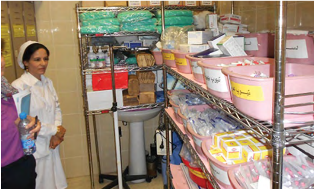
Figure 3. Afghan National Army hospital supply room