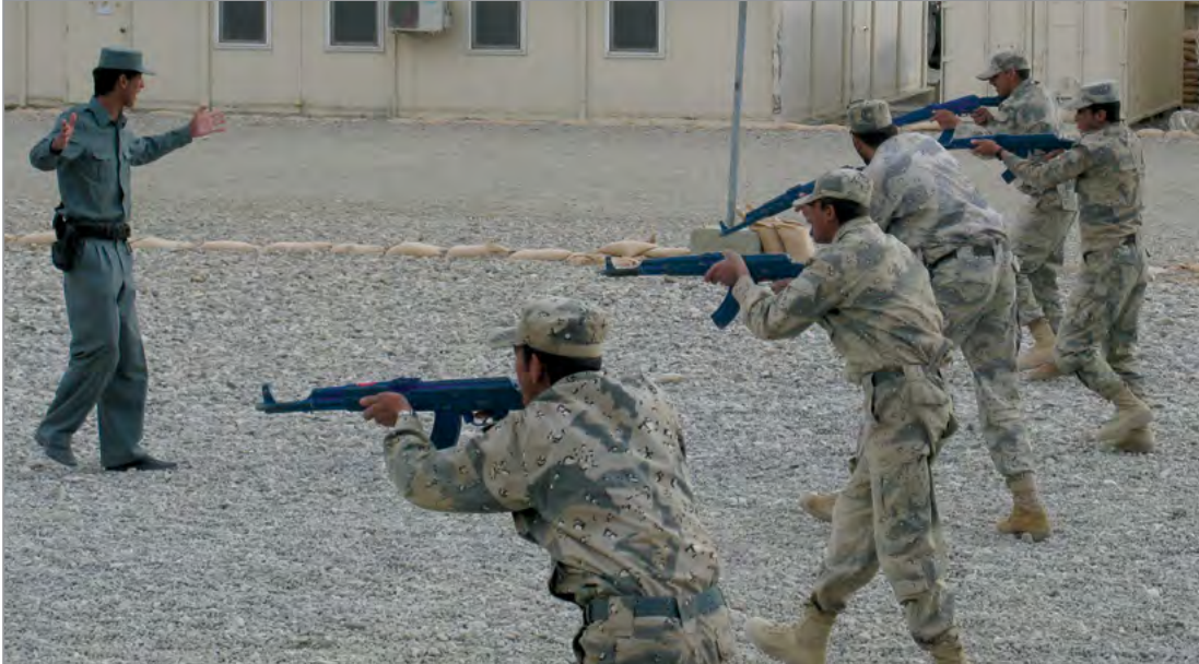
Figure 1. Afghan Border Police officers at basic training

to defend against the IED threat. 8 ANP commanders requested that they receive better equipment and that more counter-IED training be included in the program of instruction. In some cases, Afghan commanders were reluctant to send their police officers to training during the fighting season, even when training space was available. Terrain and weather also made it difficult for police officers to attend training during the winter months. 9