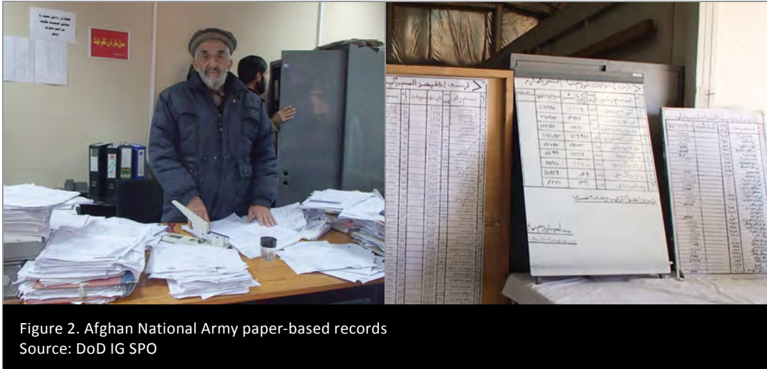
Figure 2. Afghan National Army paper-based records

The Coalition lacked a comprehensive and integrated plan for providing computer automation and information technology to the ANSF that properly recognized and adapted to the educational, literacy, and electrical power limitations inherent to Afghanistan. The complexity of computer automation and information technology provided by the Coalition exceeded ANSF capacity to assimilate, integrate, and sustain this capability. Moreover, the costs to implement, operate, and maintain advanced automated systems could be beyond the ability of partner nations' forces to fund required maintenance.