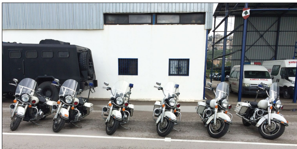
Figure 4: Photograph of Lebanese Internal Security Forces' Police Motorcycles Prepared for End-Use Monitoring

trucks, were unavailable for inspection because the ISF had deployed them on missions. 30 Figure 4 shows police motorcycles provided to the ISF that were inventoried by serial number.