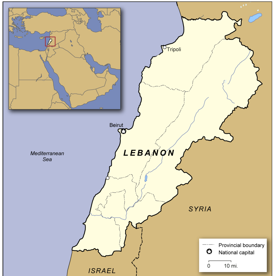
Figure 1: Map of Lebanon and Its Neighbors

Source: GAO; based on United Nations map and Map Resources (maps). | GAO-20-176