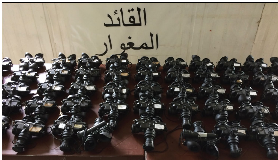
Figure 5: Photograph of Lebanese Armed Forces' Night Vision Devices Prepared for Enhanced End-Use Monitoring

provided documentation showing it was out for repair. 36 Figure 5 shows night vision devices provided to the LAF that were inventoried by serial number.