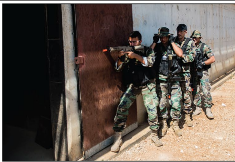
Figure 2: Examples of Types of Security Assistance to Lebanon, Fiscal Years 2013-2018