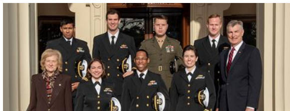
Meyer Scholar Program & WTI Scholars