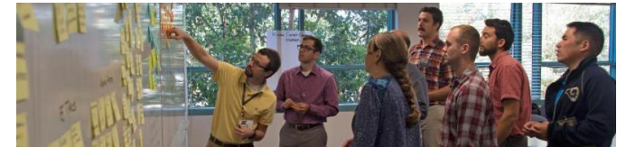
Warfare Innovation Continuum