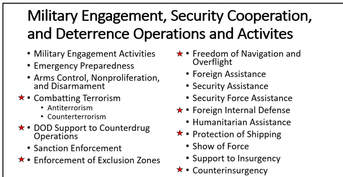
Figure 3. Typical Operations and Activities of Military Engagement, Security Cooperation, and Deterrence.