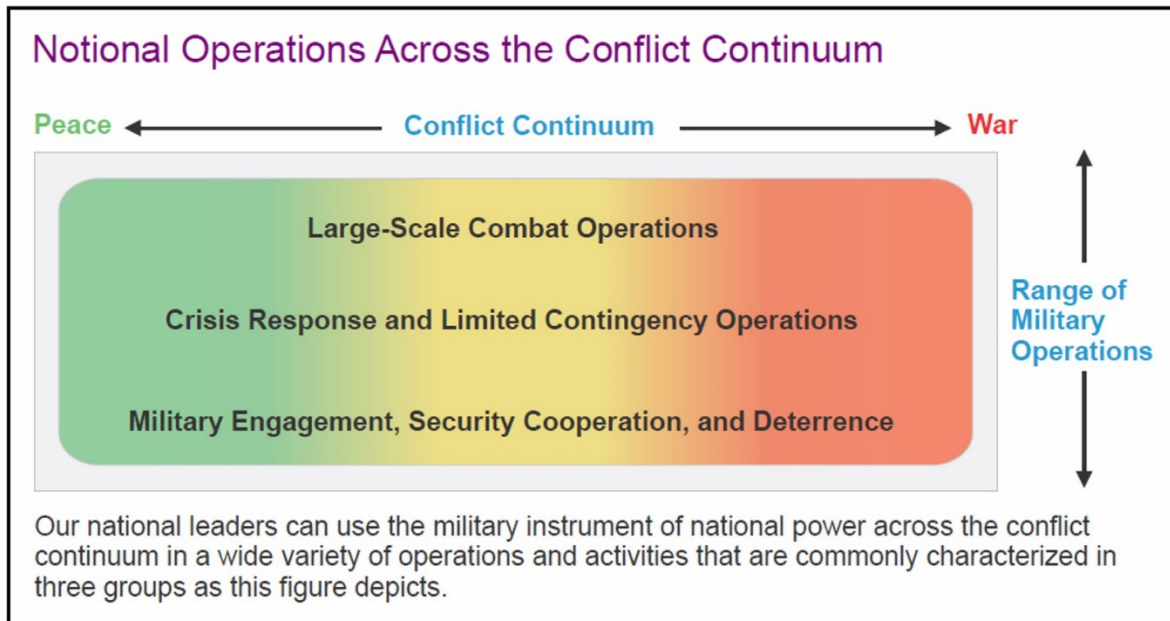
Figure 2. Range of Military Operations. Joint Publication (JP) 3-0, Joint Operations (Washington, DC: Government Printing Office, 2017), V-4.